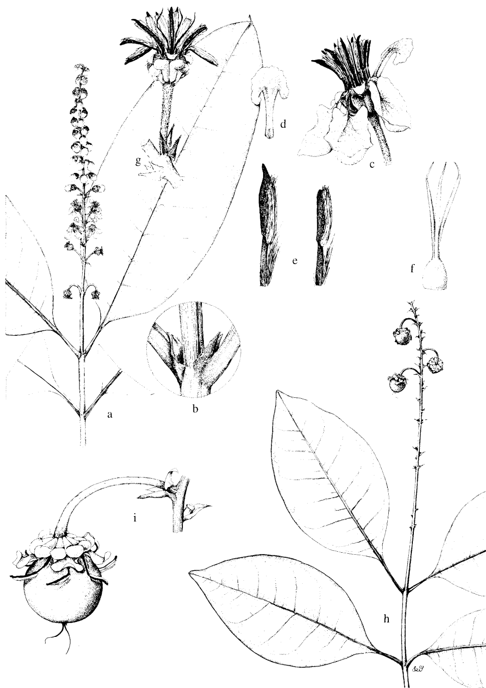
FIG. 1. Byrsonima riparia . a) flowering branch, \times 0.5 ; b) stipules, \times 2.5 ; c) flower, \times 2.5 ; d) posterior petal, \times 2.5 ; e) stamens, anterior (left) and posterior (right), \times 5 ; f) gynoecium, \times 5 ; g) old flower with bracts and bracteoles falling, \times 2.5 ; h) fruiting branch with many bracts and bracteoles persistent, \times 0.5 ; i) fruit, \times 2.5 . Drawn by Karin Douthit; a–g from Prance 6849; h–i from Sidney [Fonseca] 1299.